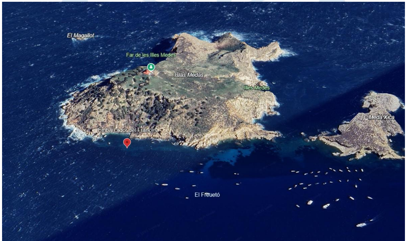
Diving spots in Meda Gran Island

3.8. The thematic photo for this World Cup will be: Grouper, Epinephelus marginatus .